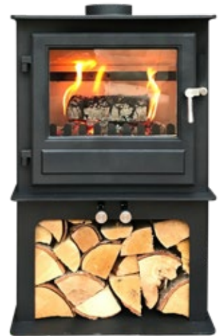
Black & Stainless Steel Log Box Option